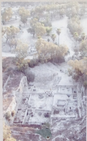
Overhead View of the Excavation Area and the Center of Ashkelon National Park