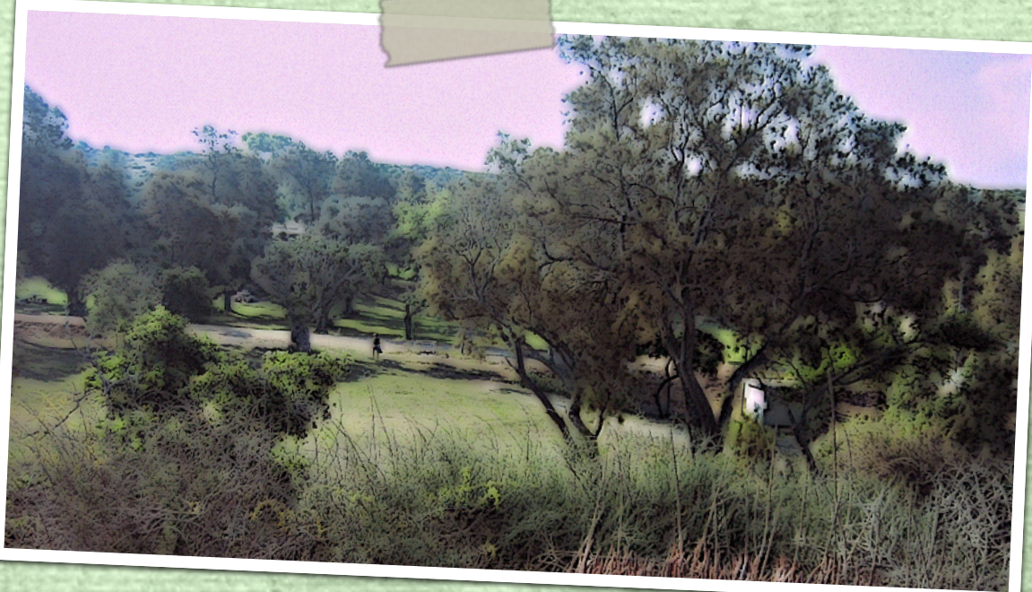
WE DON'T KNOW WHERE THE PALACE WAS LOCATED. WE HAVE NEVER FOUND ANY EVIDENCE OF IT. ASHKELON WAS PART OF THE ROMAN EMPIRE FROM THE 1ST CENTURY B.C.E UNTIL 330 C.E.